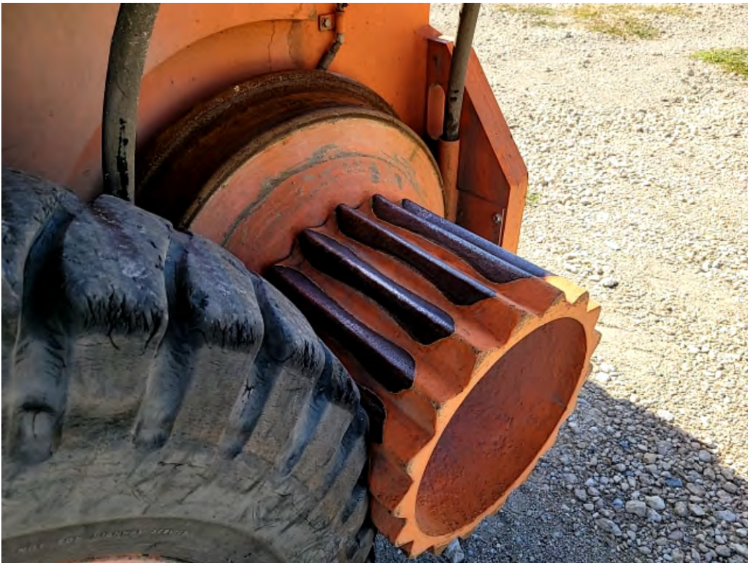
Front Right Drive Hub / 09-27-2021