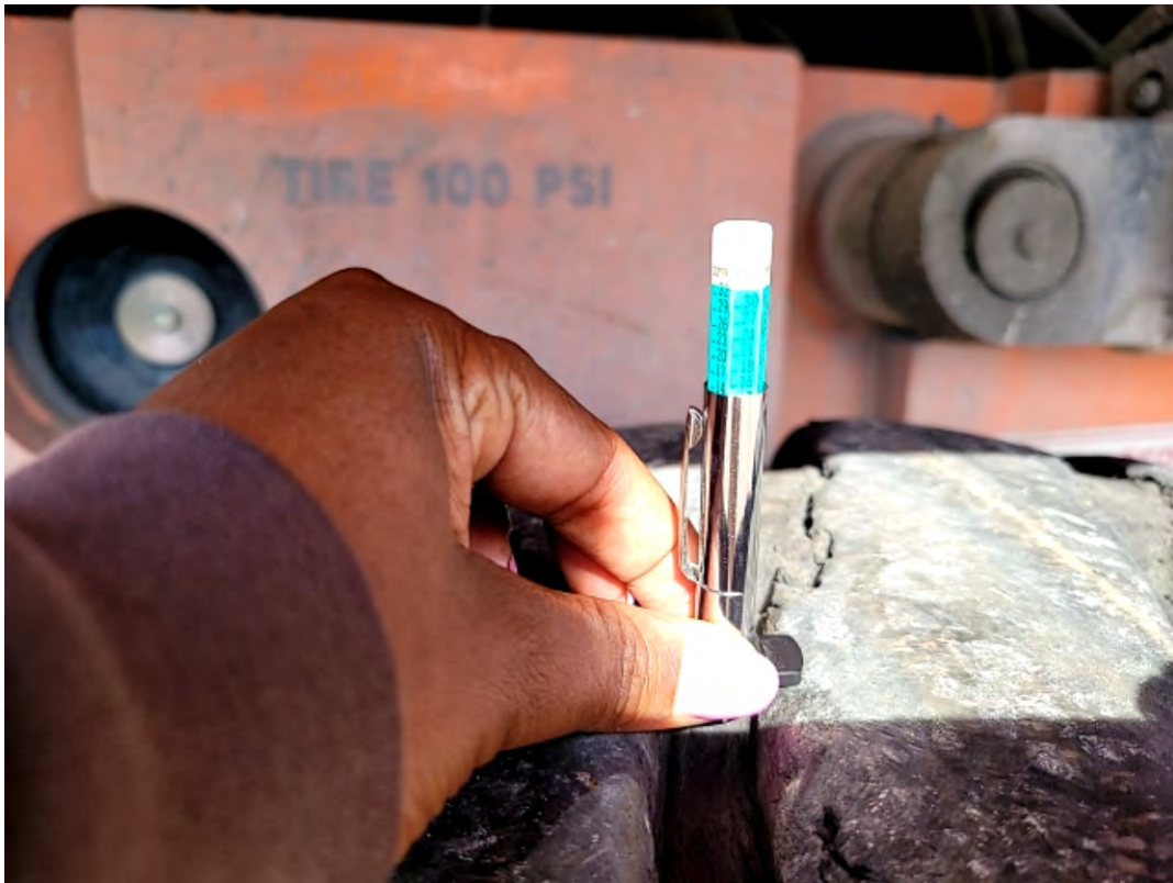
Front Left Tire Tread Depth / 09-27-2021