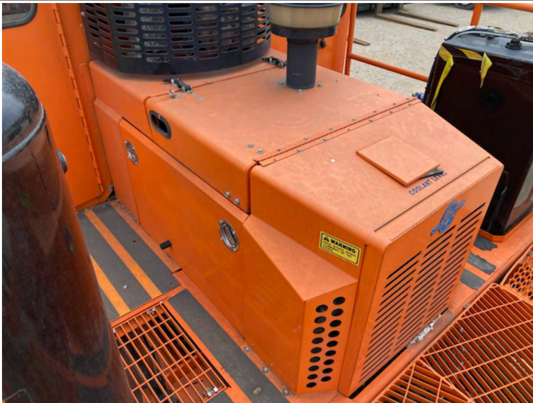
Engine Compartment / Intake Screen / 09-28-2021