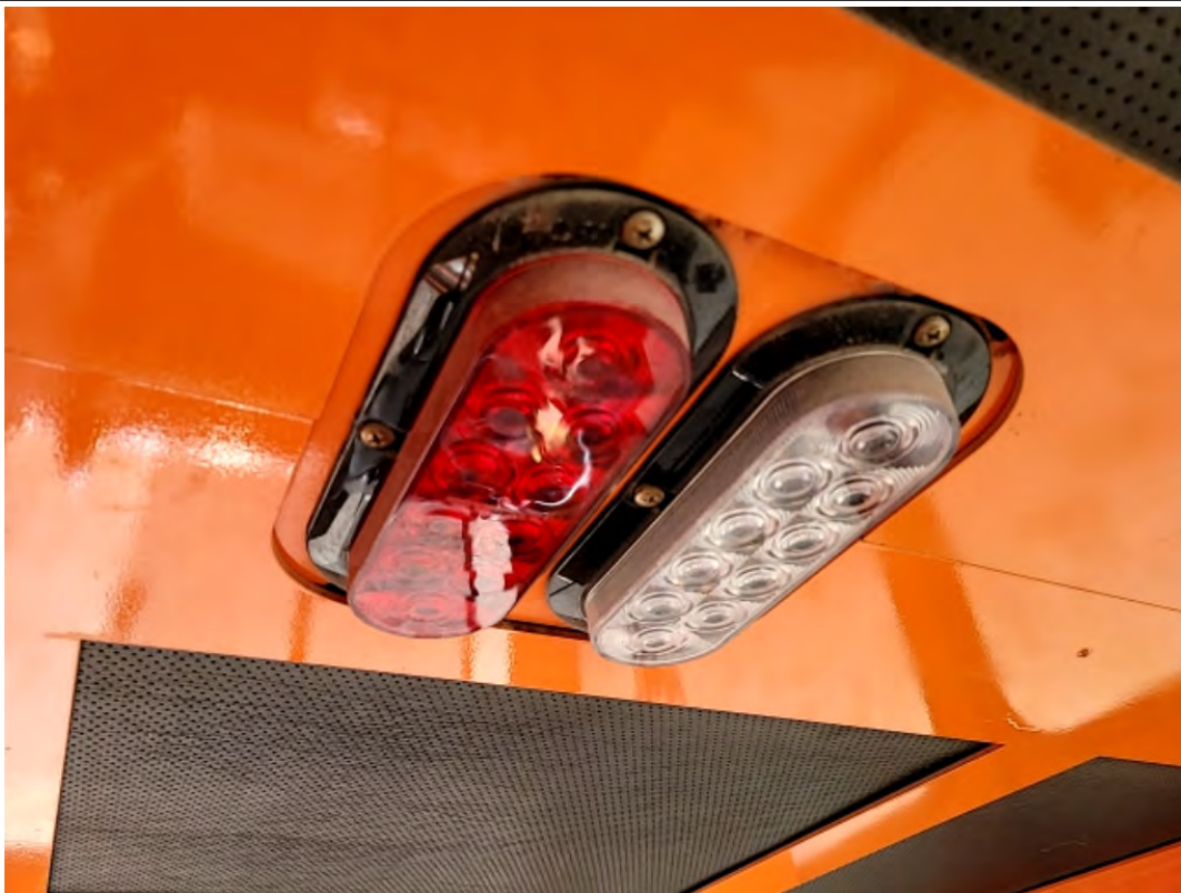
Cab Lights / Interior / 09-27-2021