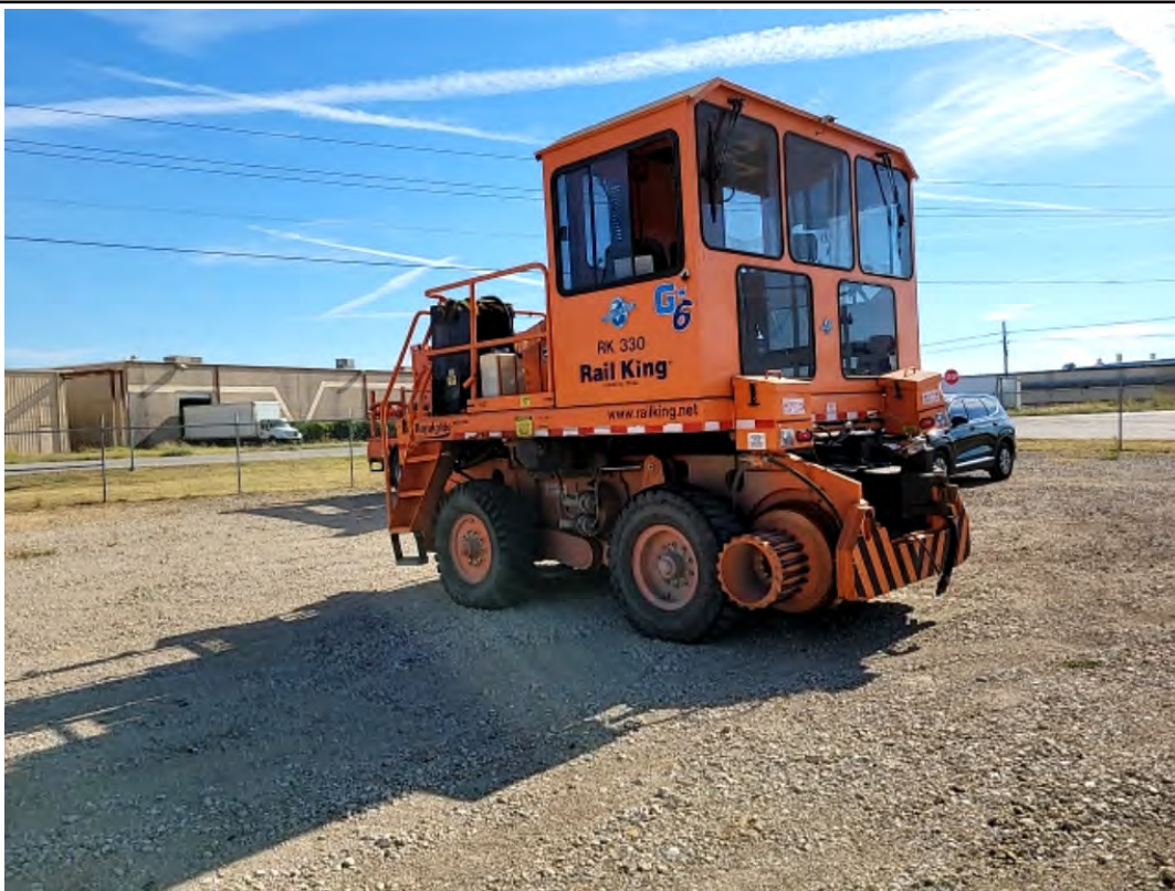
Front Right / 09-27-2021