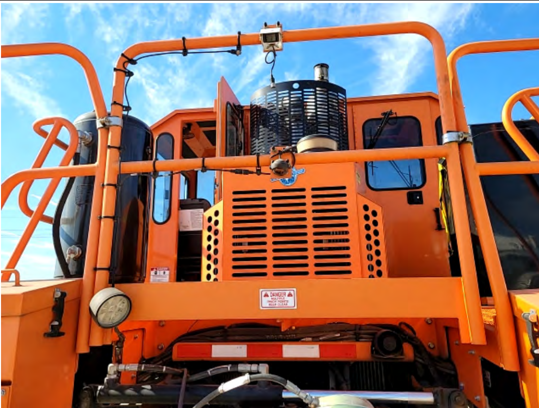
Intake Screen / Backup Camera / 09-27-2021