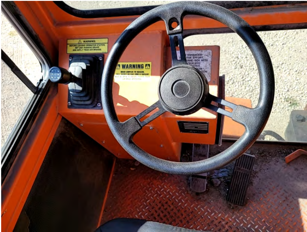
Steering Wheel / 09-27-2021