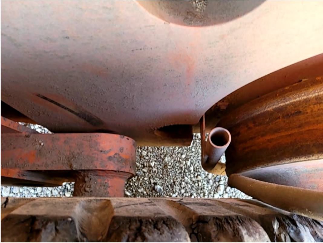
Front Right Wheel Axle / 09-27-2021