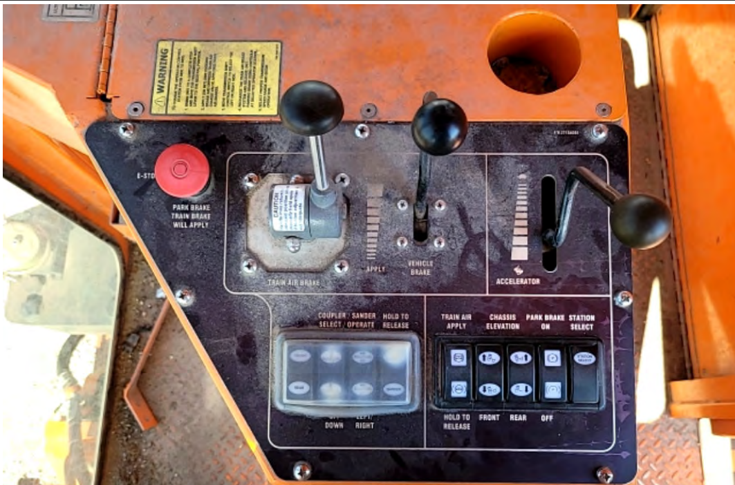
Controls / 09-29-2021