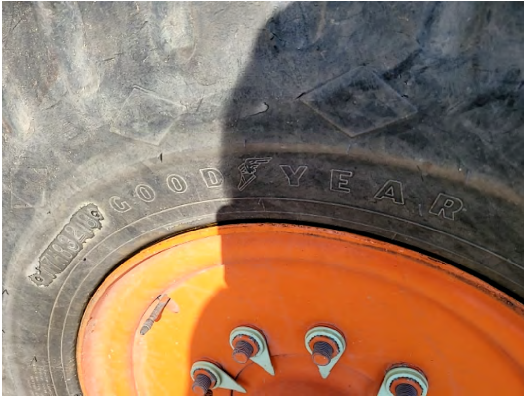
Back Left Tire Brand / Back Left Tire Part Number / 09-27-2021