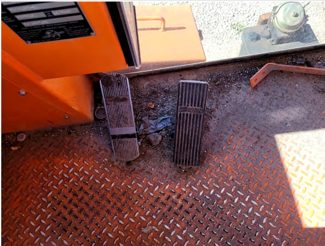
Left / Pedals / 09-27-2021