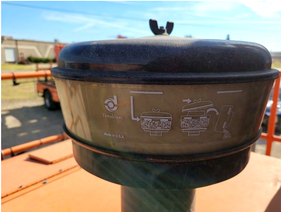
Pre-Cleaner Bowl / 09-27-2021