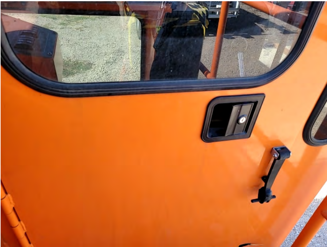
Cab Door / 09-27-2021