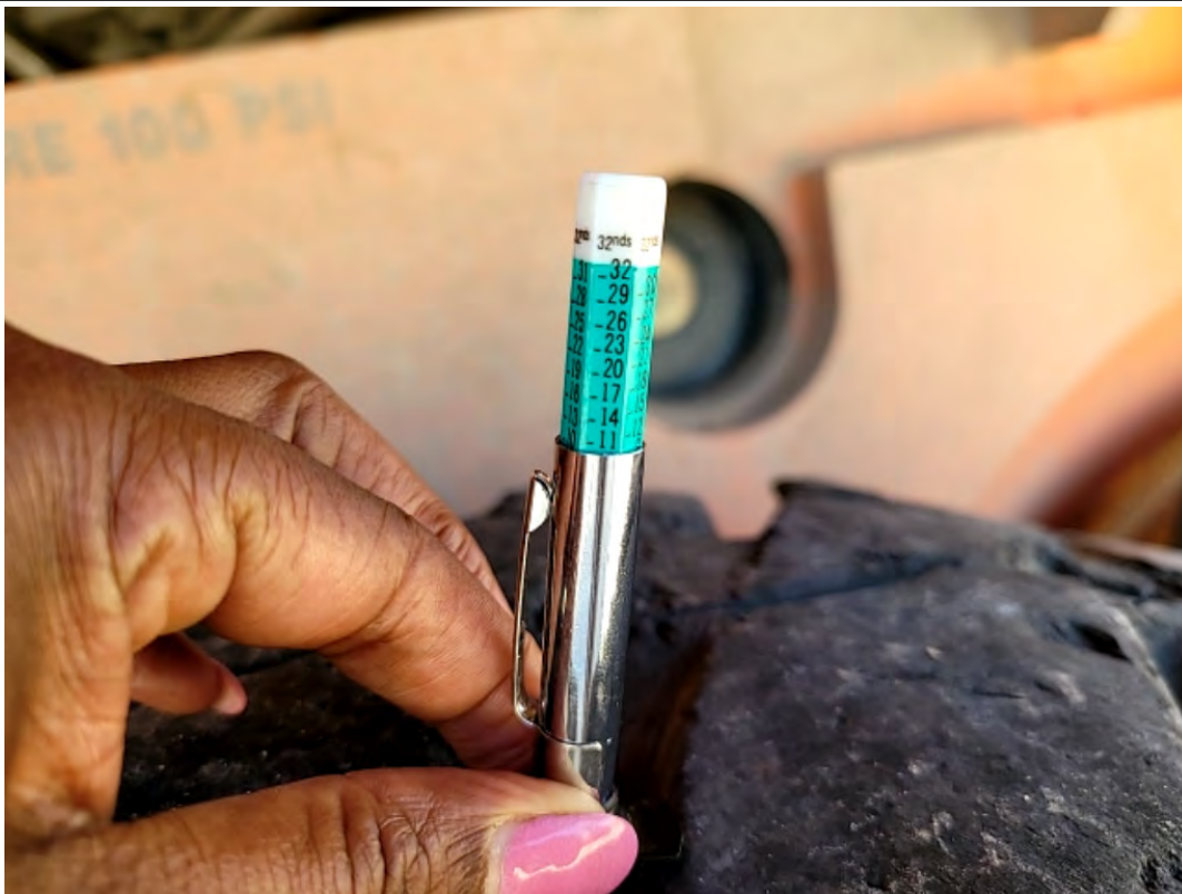
Front Right Tire Tread Depth / 09-27-2021