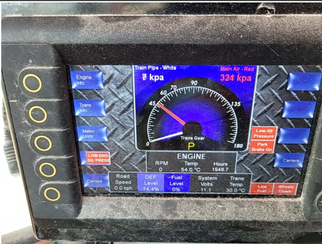
1548 / Hours / 09-27-2021