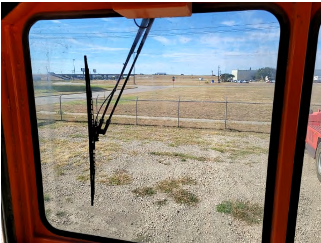
Front Cab Glass / Interior / 09-27-2021