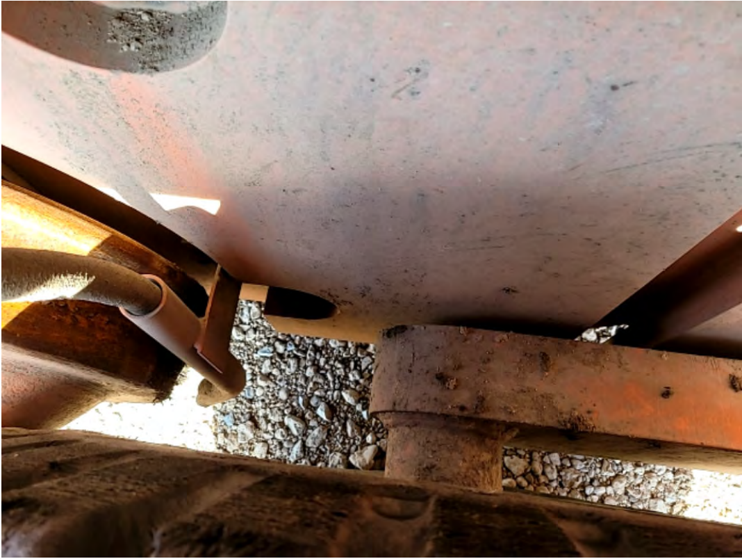
Front Left Wheel Axle / 09-27-2021