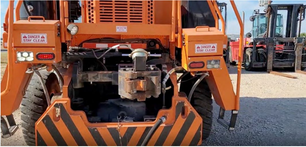
Tailgate Lights / 09-29-2021