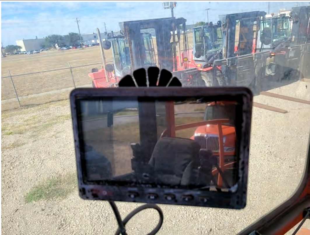
Backup Camera / 09-27-2021