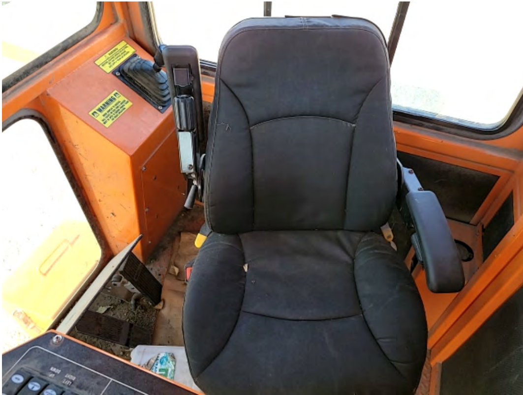
Right / Seat / 09-27-2021