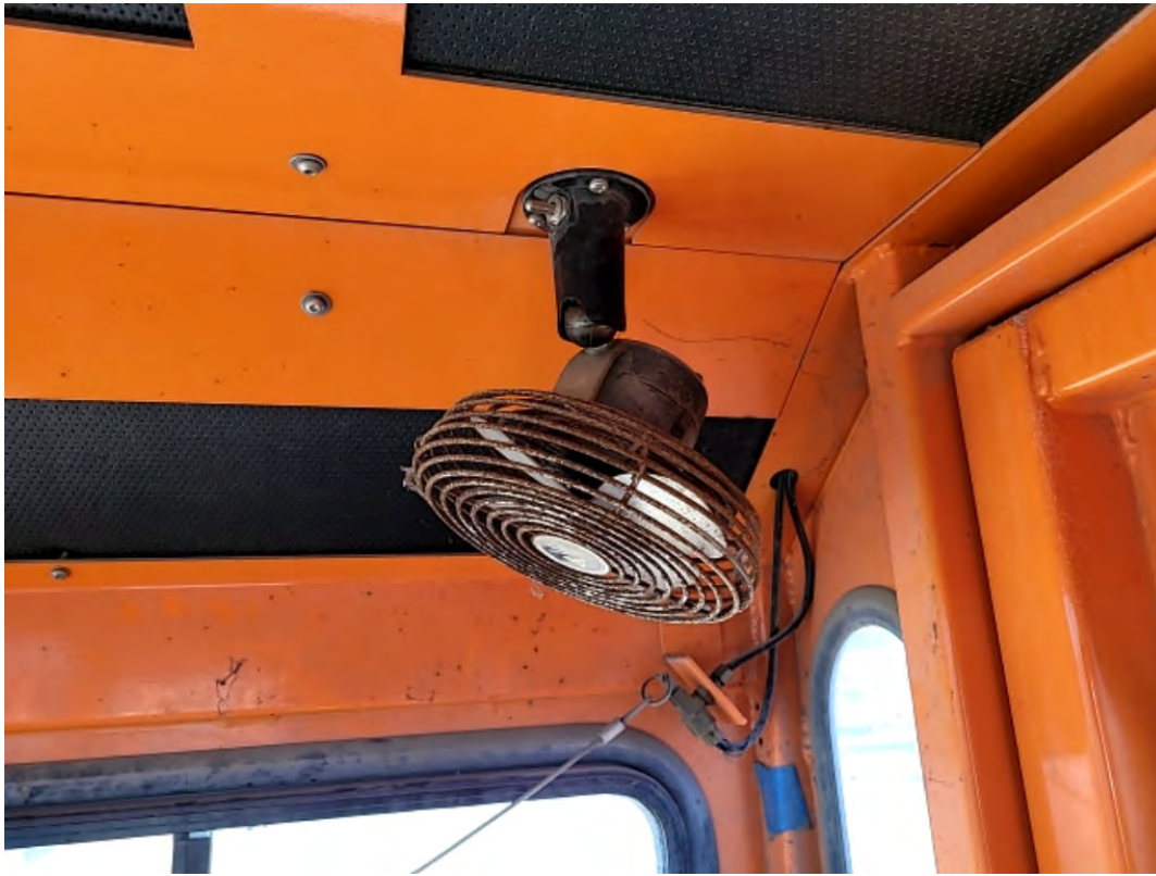
Cab Fan / Interior / 09-27-2021