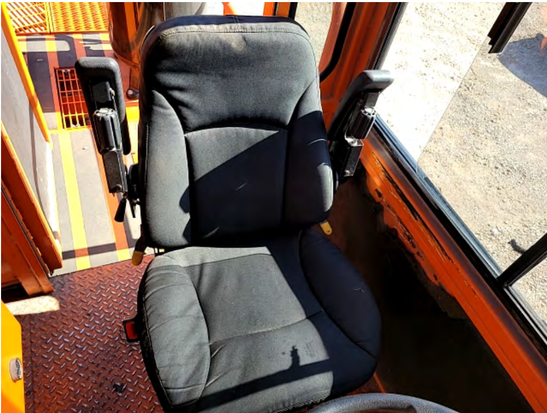
Left / Seat / 09-27-2021