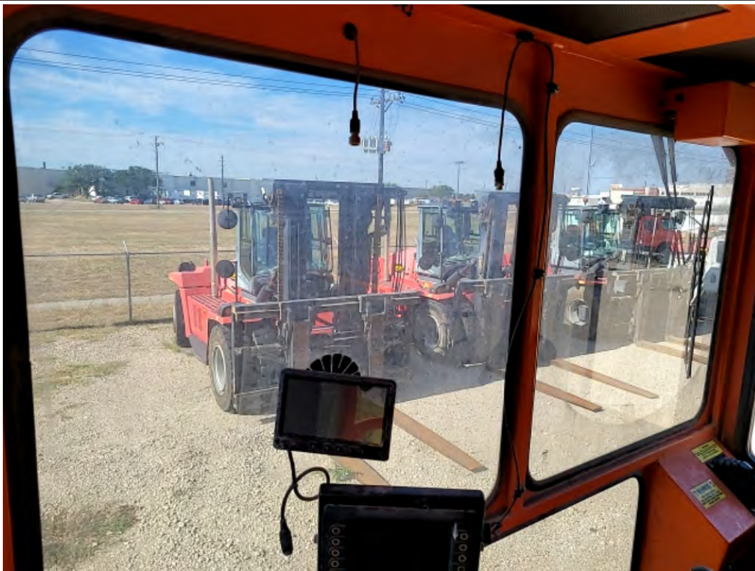
Front Glass/Cab / Interior / 09-27-2021