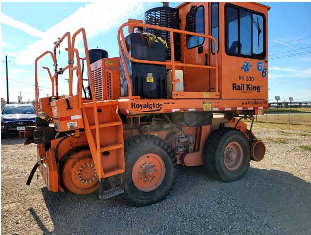
ROPS Condition / 09-27-2021