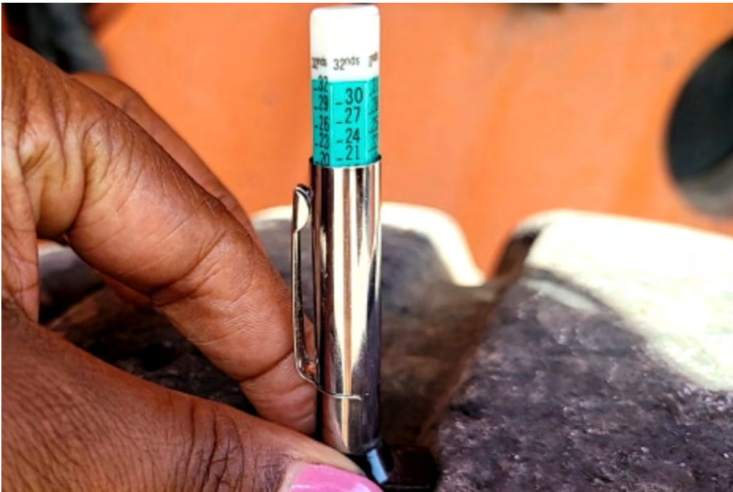
Back Right Tire Tread Depth / 09-29-2021