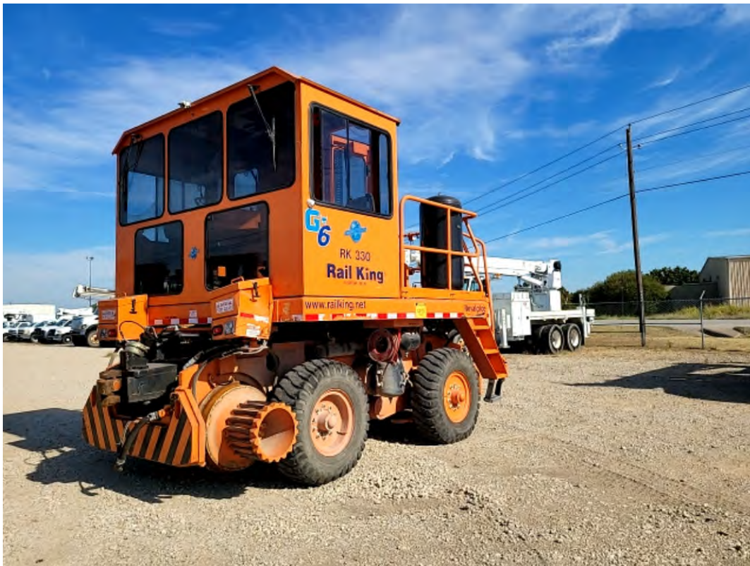
Front Left / 09-27-2021