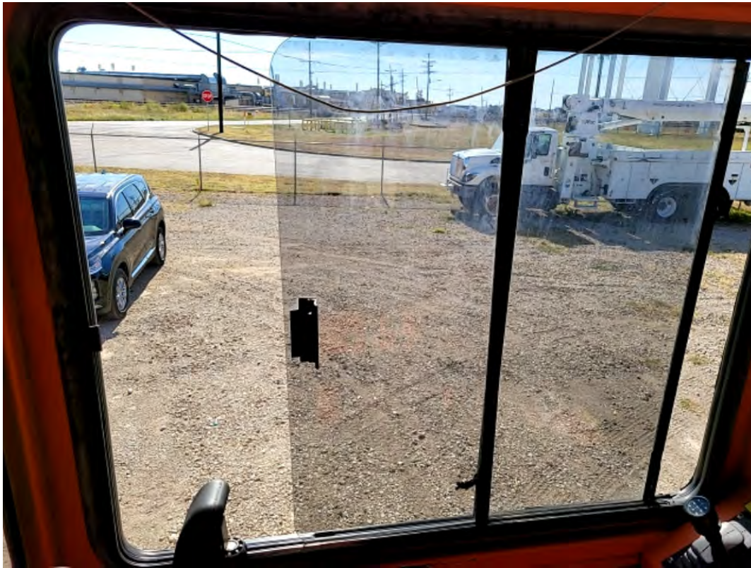
Left Cab Glass / Interior / 09-27-2021