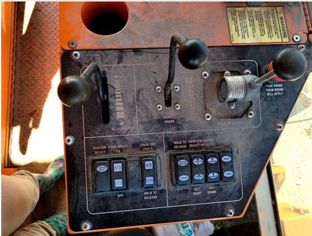
Controls / 09-27-2021