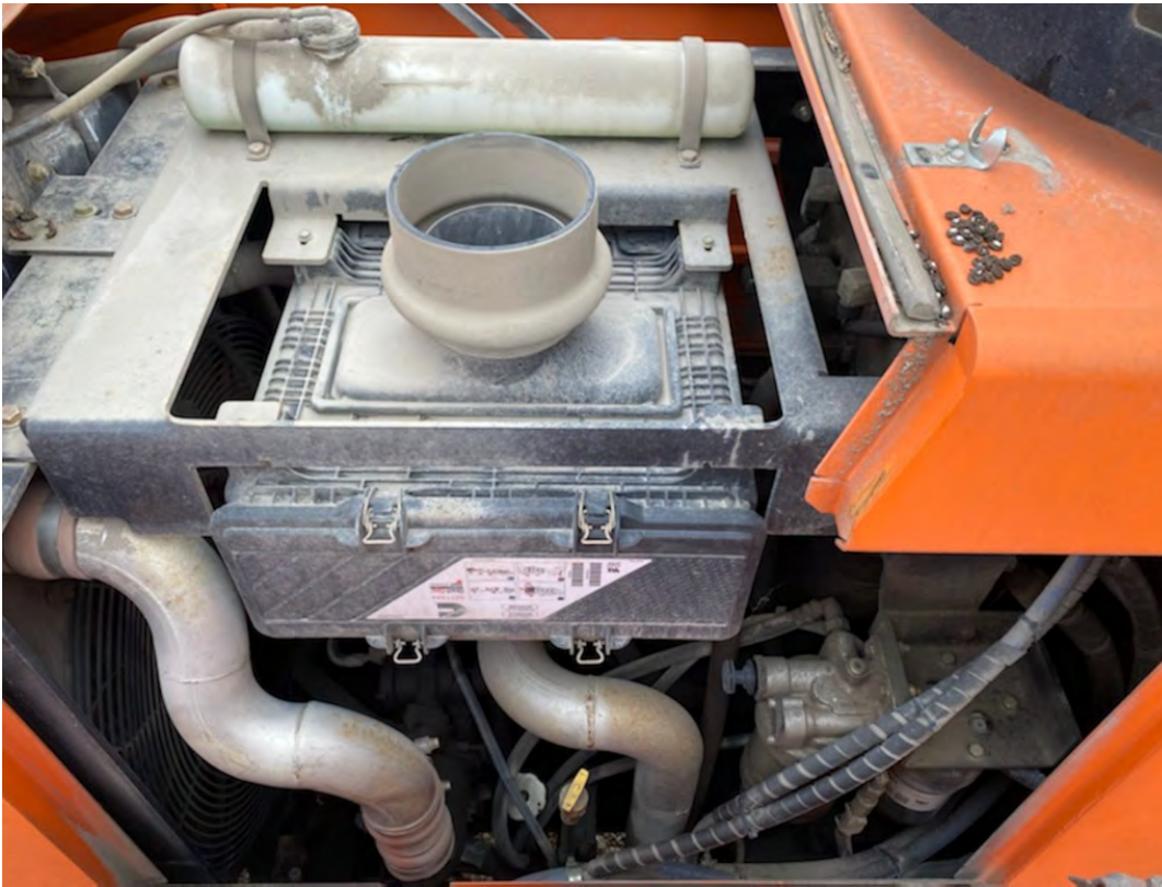
Engine Compartment / 09-28-2021