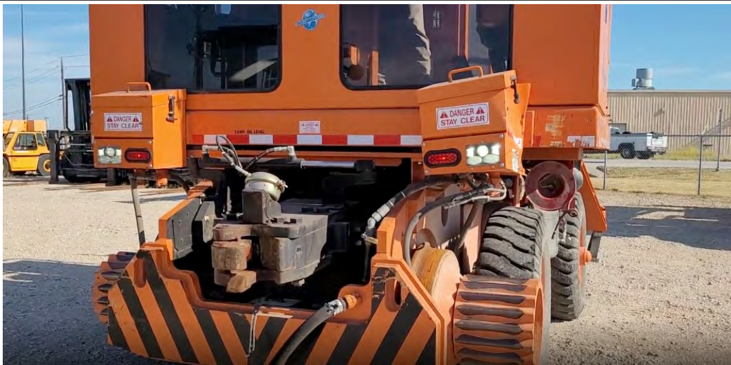
Front Hydraulic Coupler / 09-29-2021