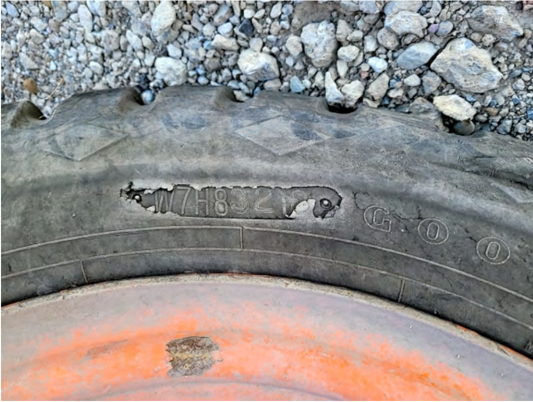
Back Right Tire Part Number / 09-29-2021