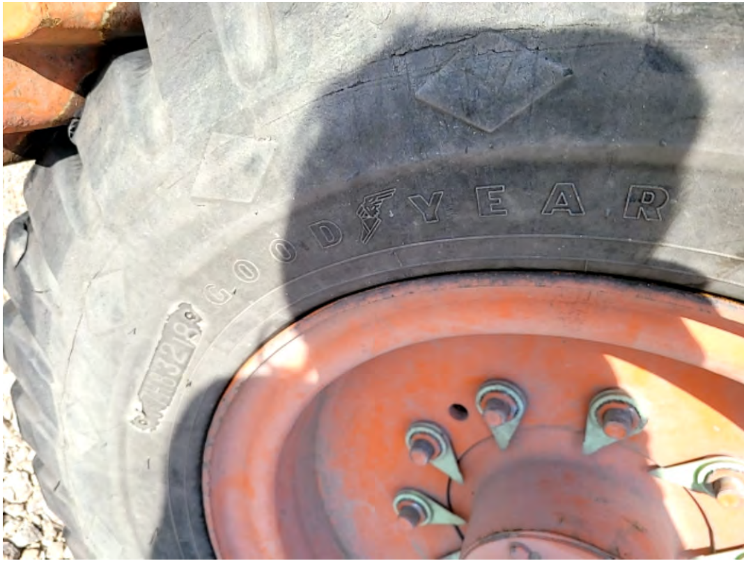
Front Left Tire Brand / Front Left Tire Part Number / 09-27-2021