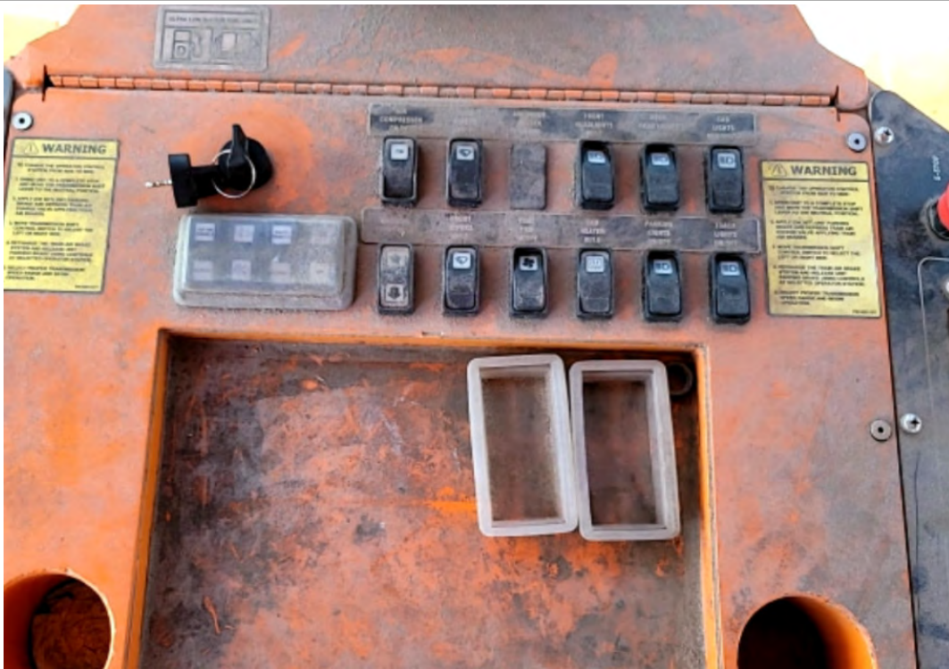
None / Keyless Start / 09-29-2021