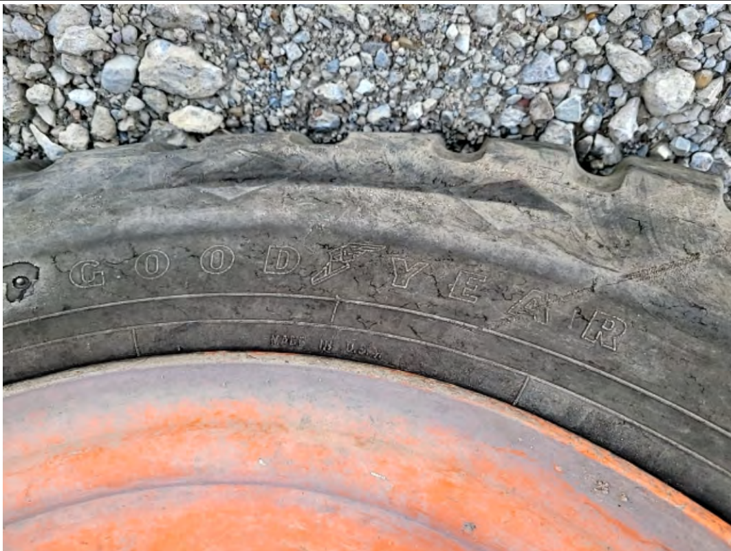
Back Right Tire Brand / 09-29-2021