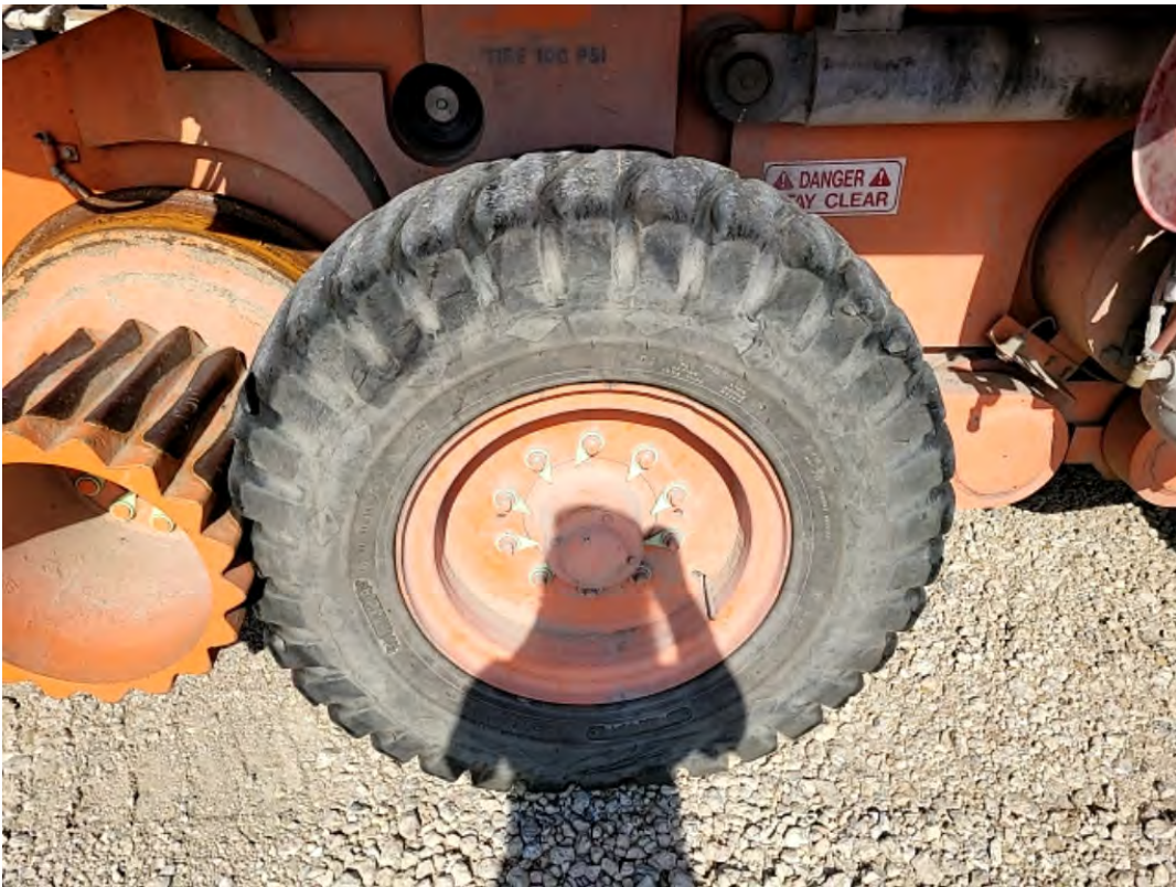
Front Left Tire Condition / 09-27-2021