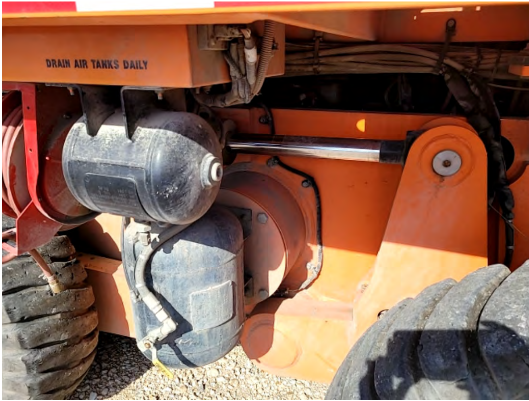
Right / Lift Cylinders / 09-27-2021