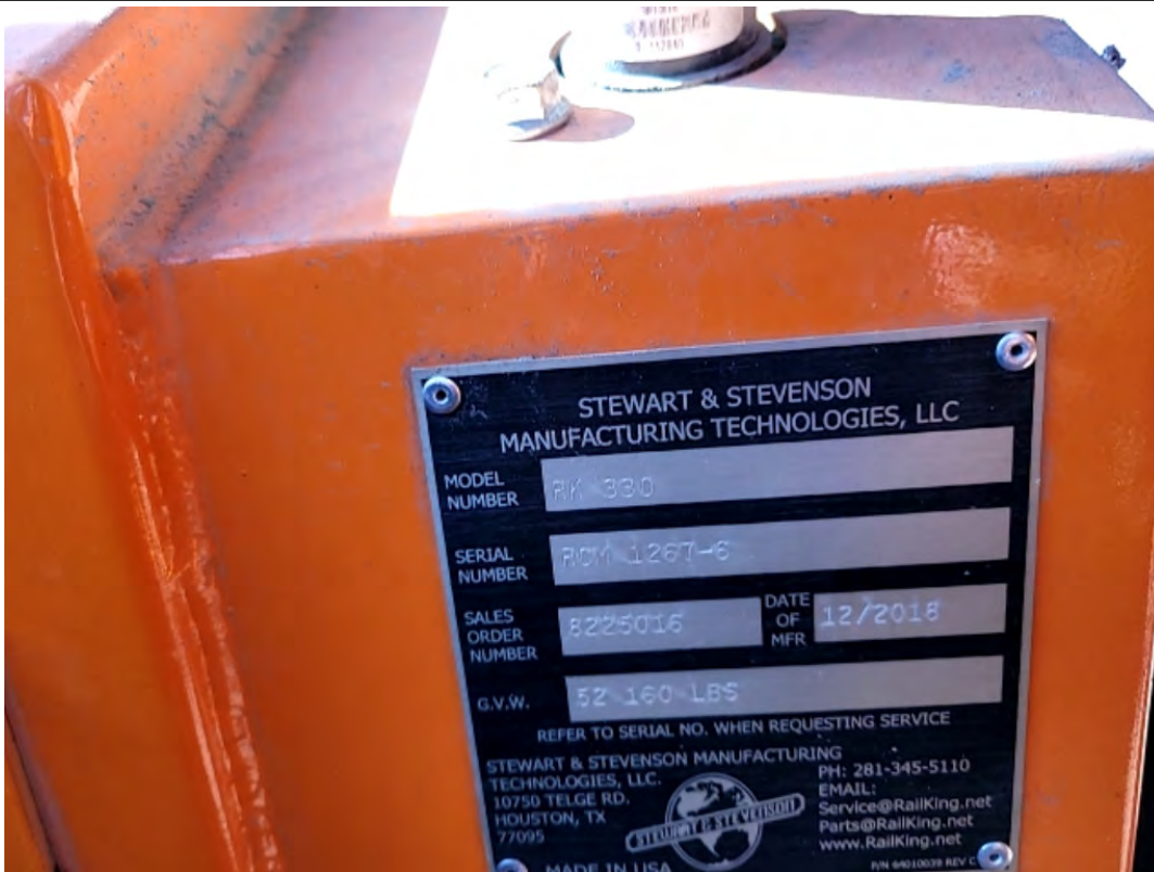
RCM12676 / Serial # / VIN # / 09-27-2021