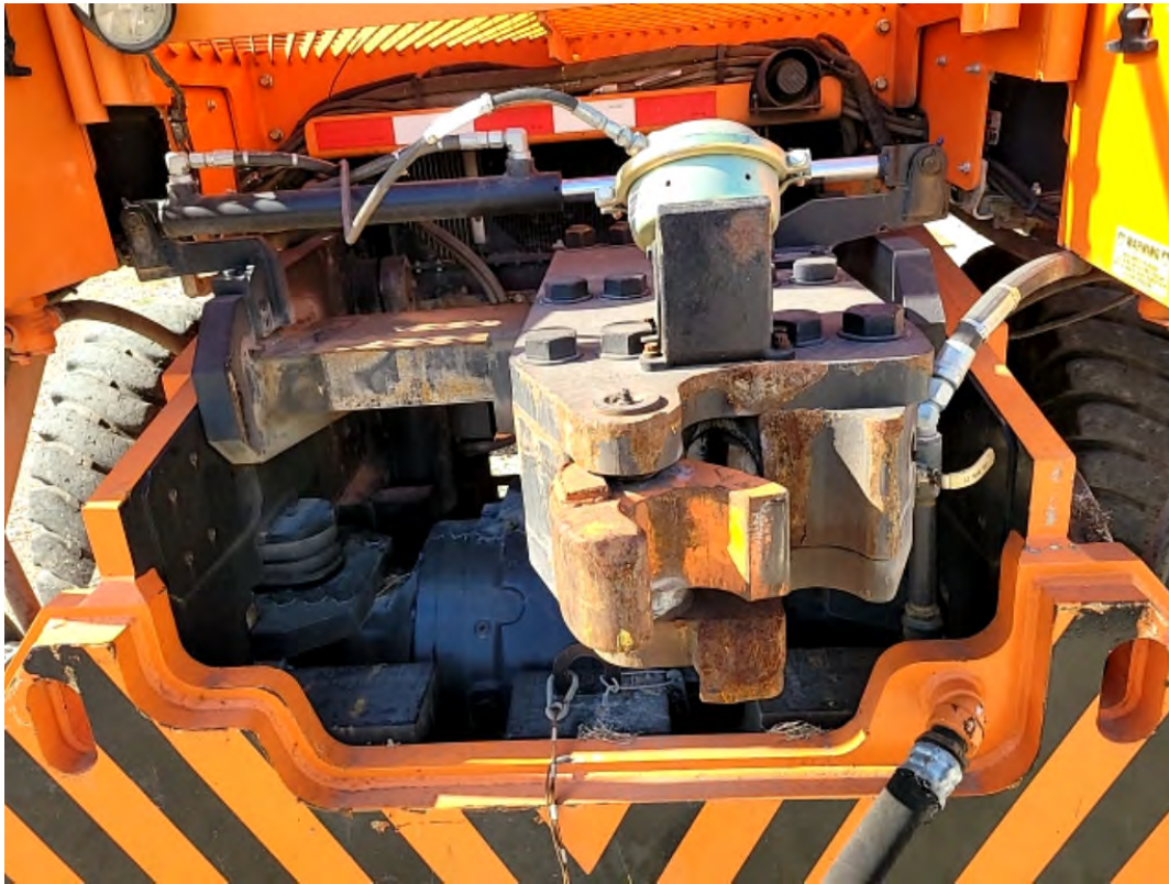
Rear Hydraulic Coupler / 09-27-2021