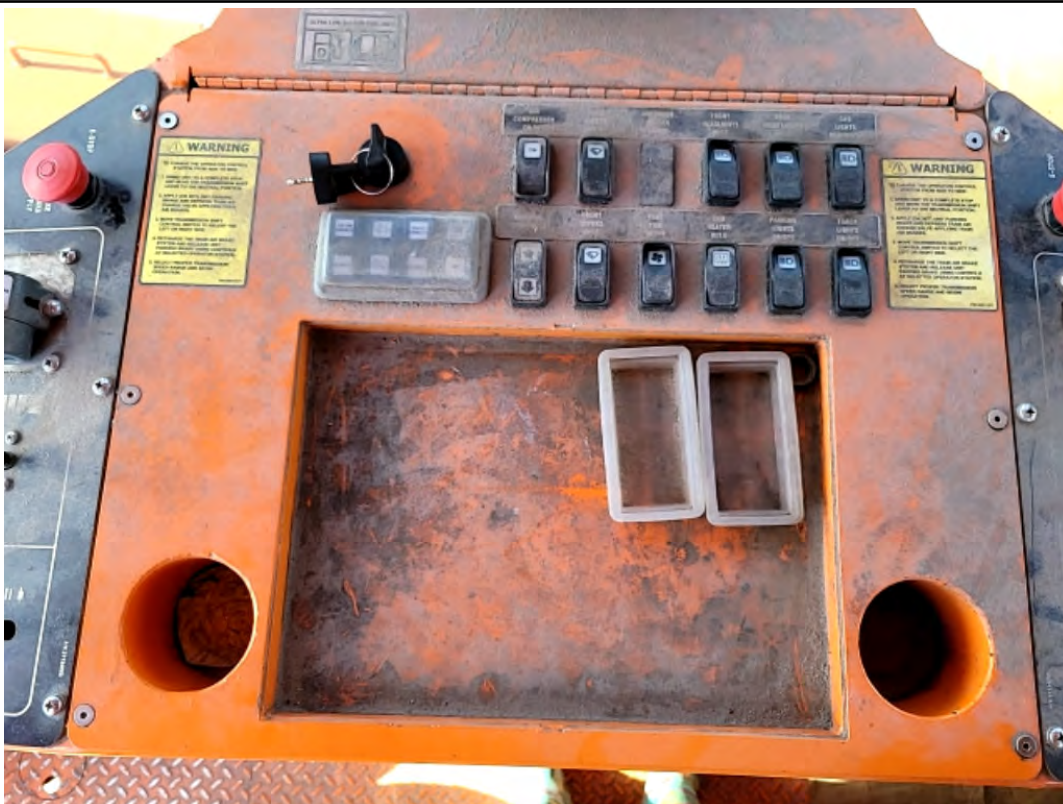
Controls / 09-27-2021