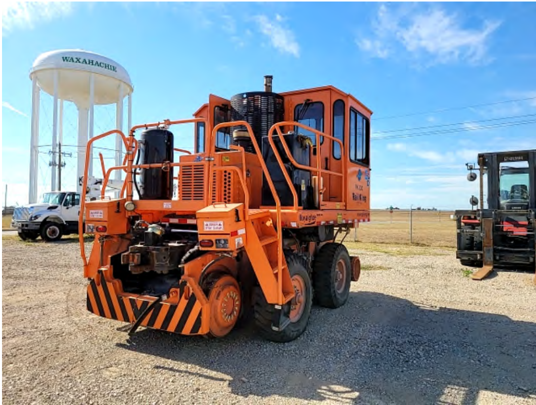
Right / Rear / 09-27-2021