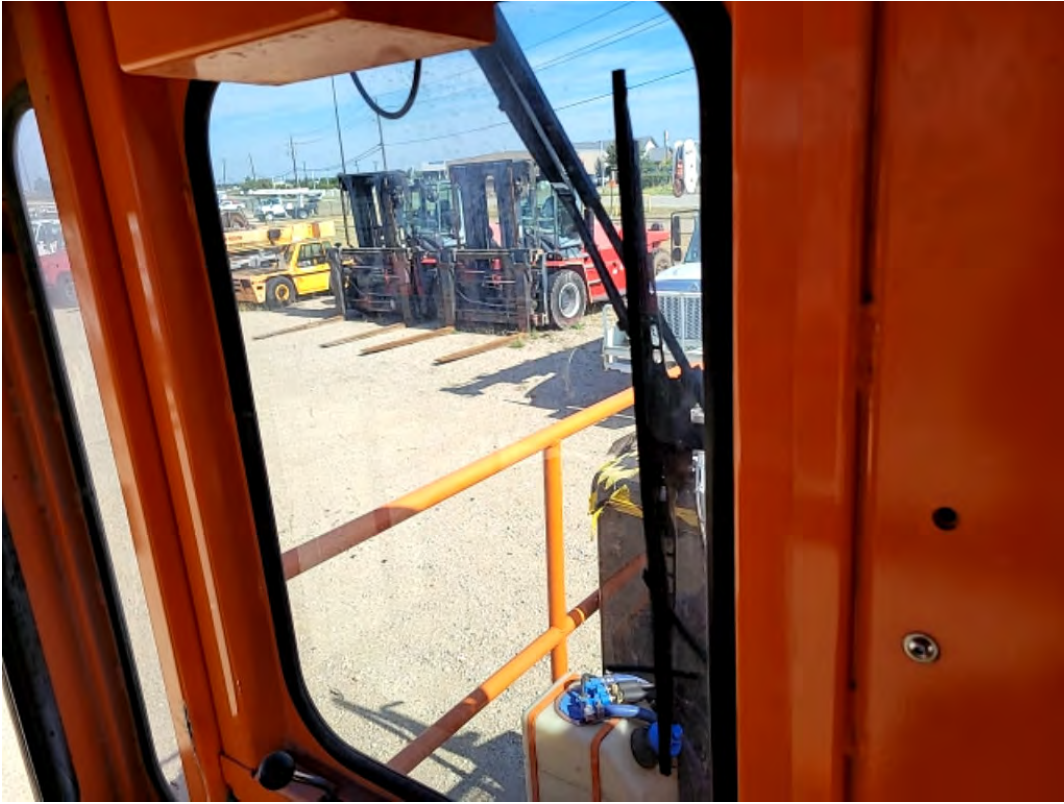
Rear and Top Window / Interior / 09-27-2021