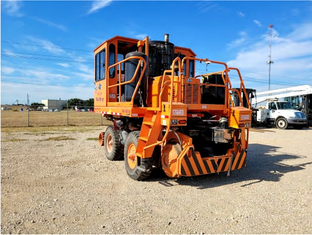
Left / Rear / 09-27-2021