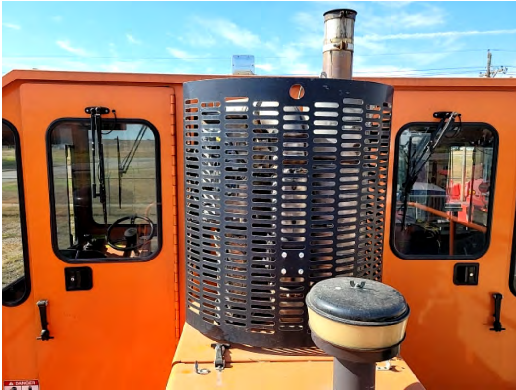
Muffler / 09-27-2021