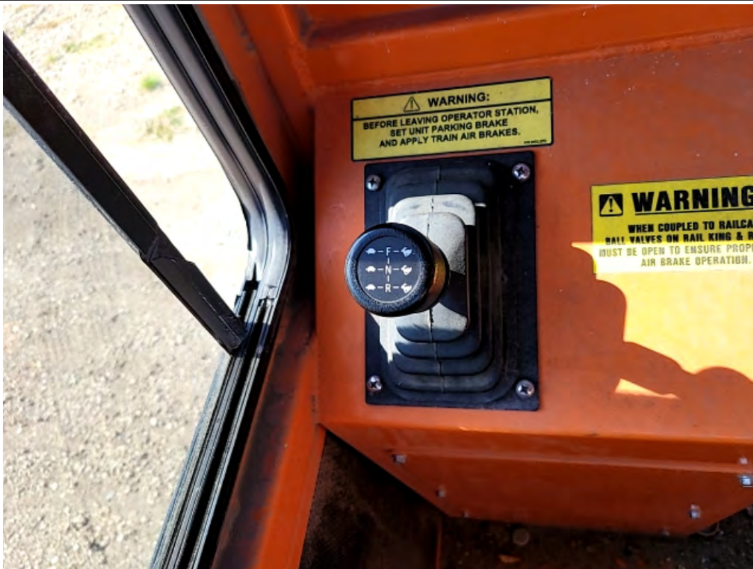
Left Control / 09-27-2021