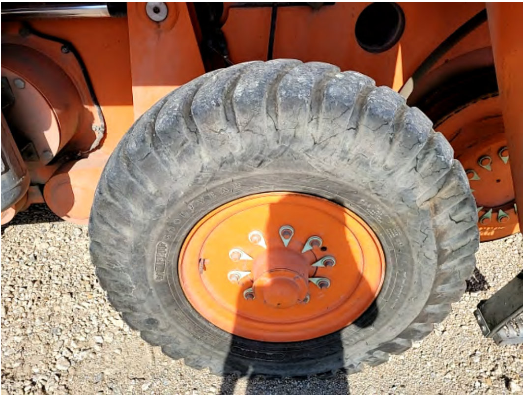
Back Left Tire Condition / 09-27-2021