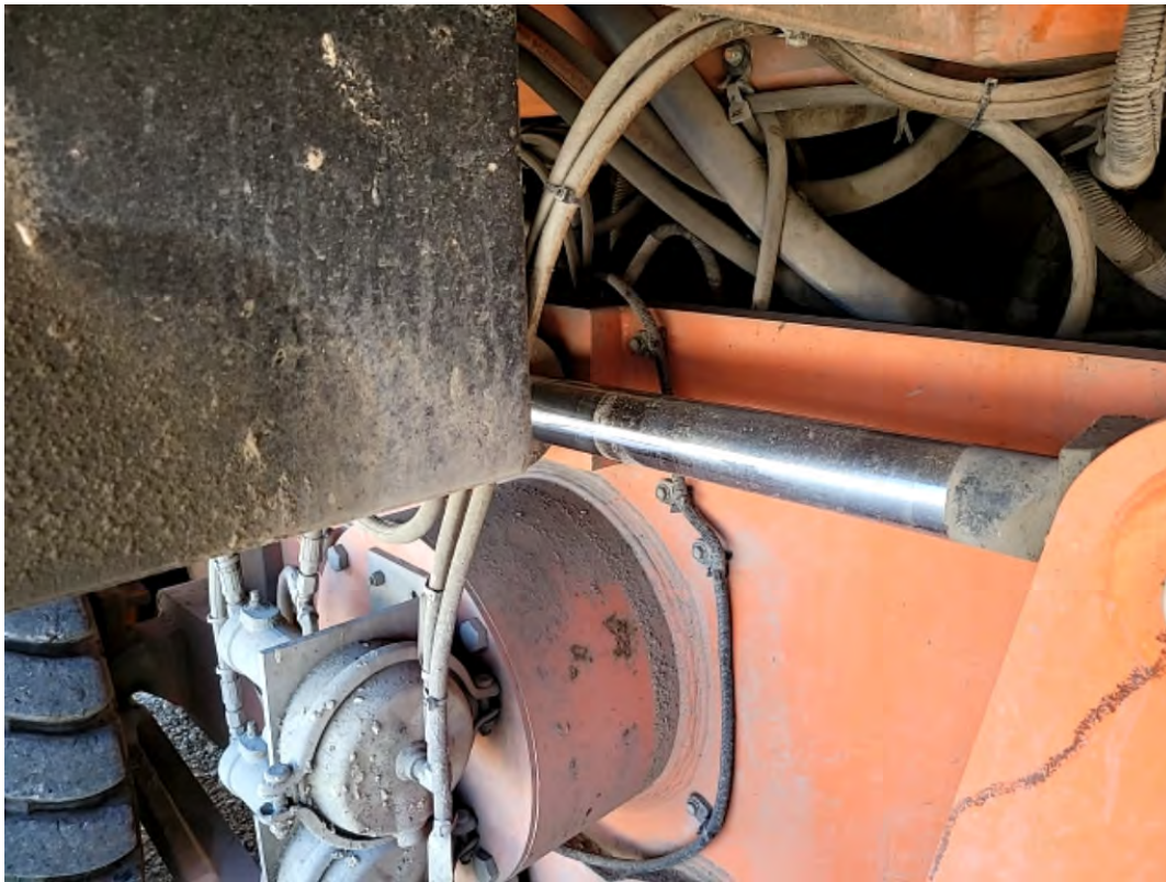
Left / Lift Cylinders / 09-27-2021