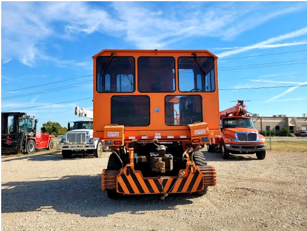
Front Glass / 09-27-2021