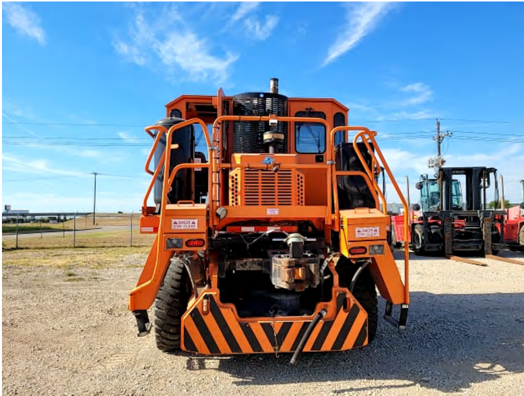
Rear and Top Window / 09-27-2021