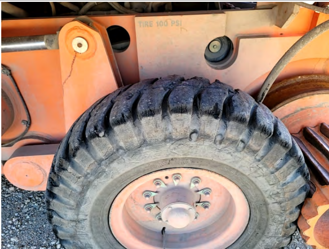
Front Right Tire Condition / 09-27-2021