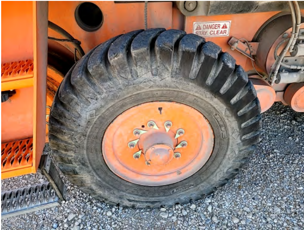
Back Right Tire Condition / 09-27-2021