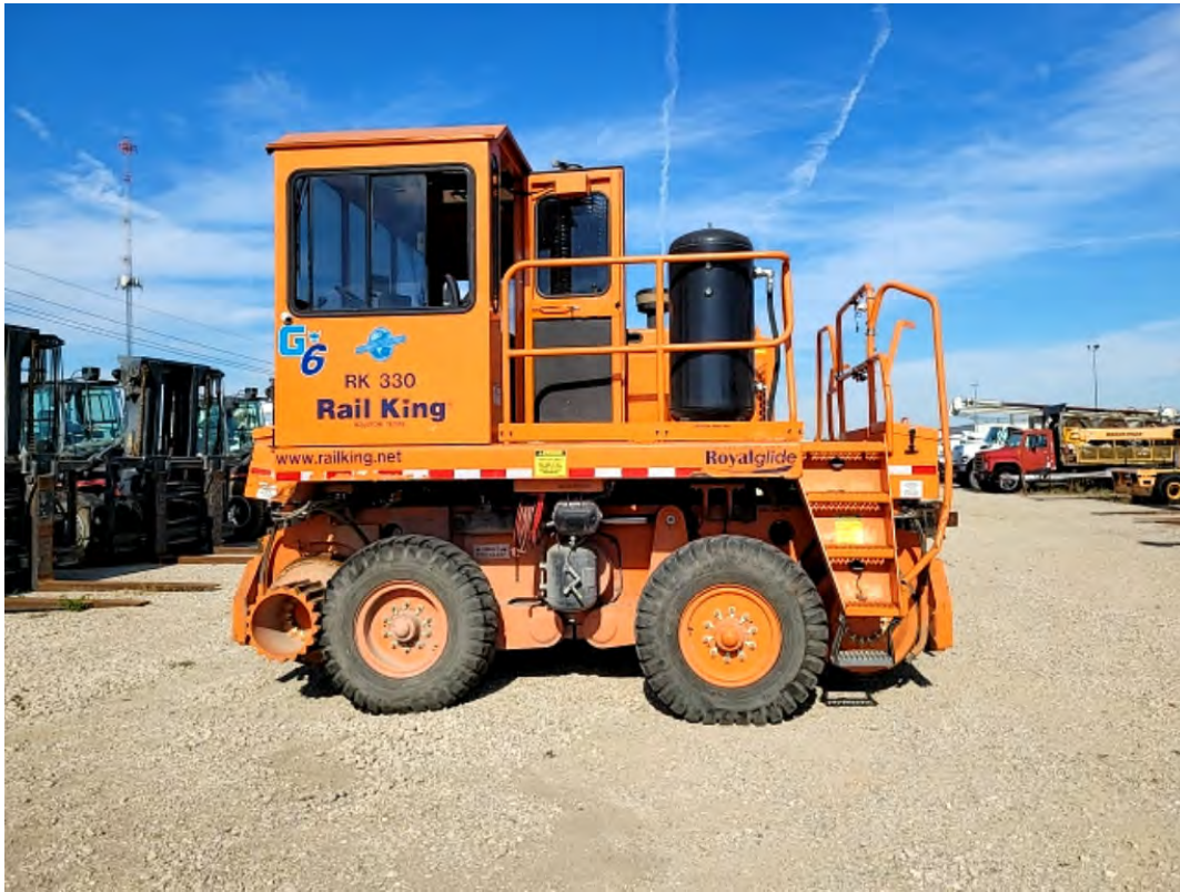
Left ROPS / 09-27-2021