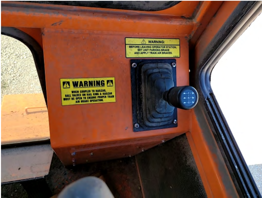
Right Control / 09-27-2021