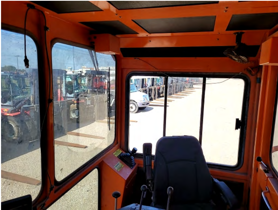
Rear Glass/Right Cab Glass / Interior / 09-27-2021