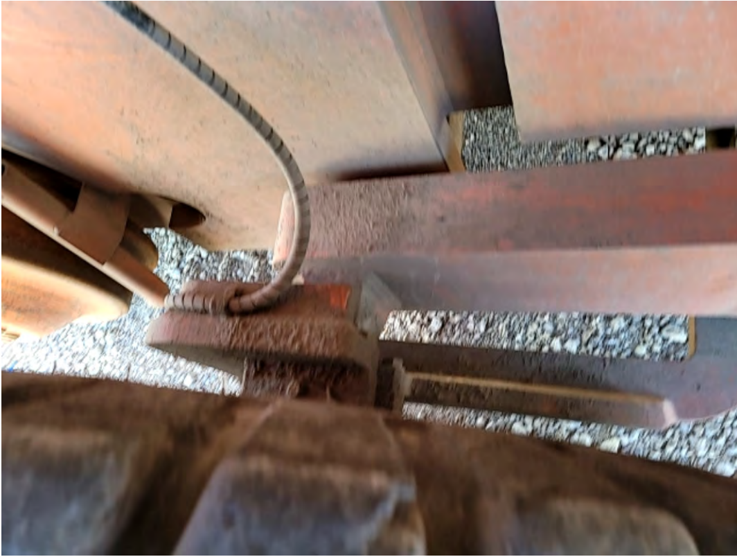
Back Right Wheel Axle / 09-27-2021