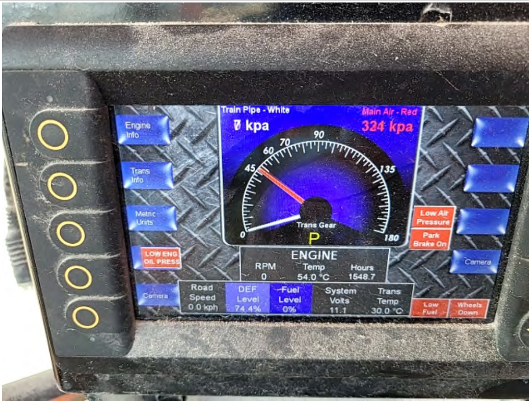
Low Engine Oil Press/Low Air Pressure / Active Warnings / 09-29-2021