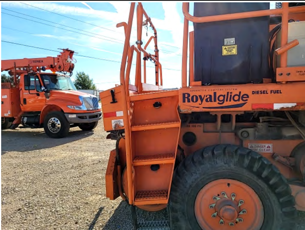
Left Stairs / 09-27-2021