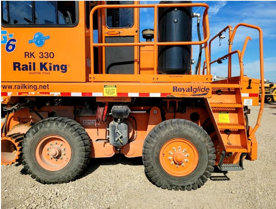
Right Stairs / 09-27-2021