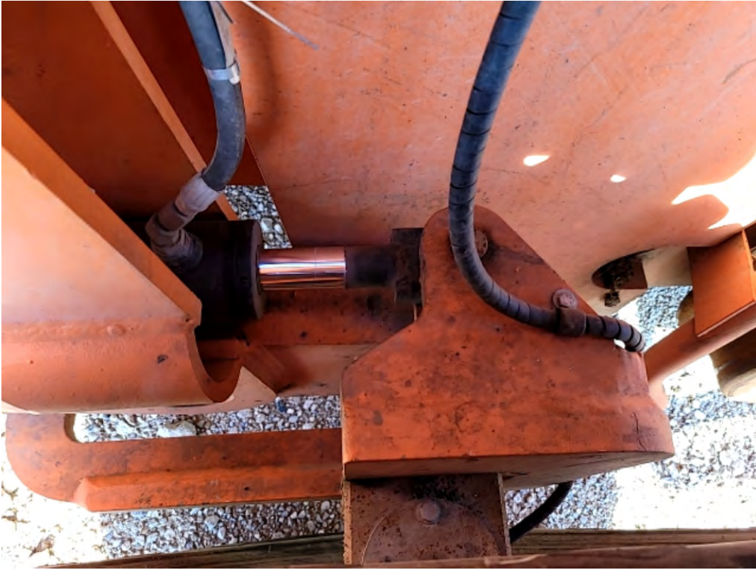
Back Left Wheel Axle / 09-27-2021