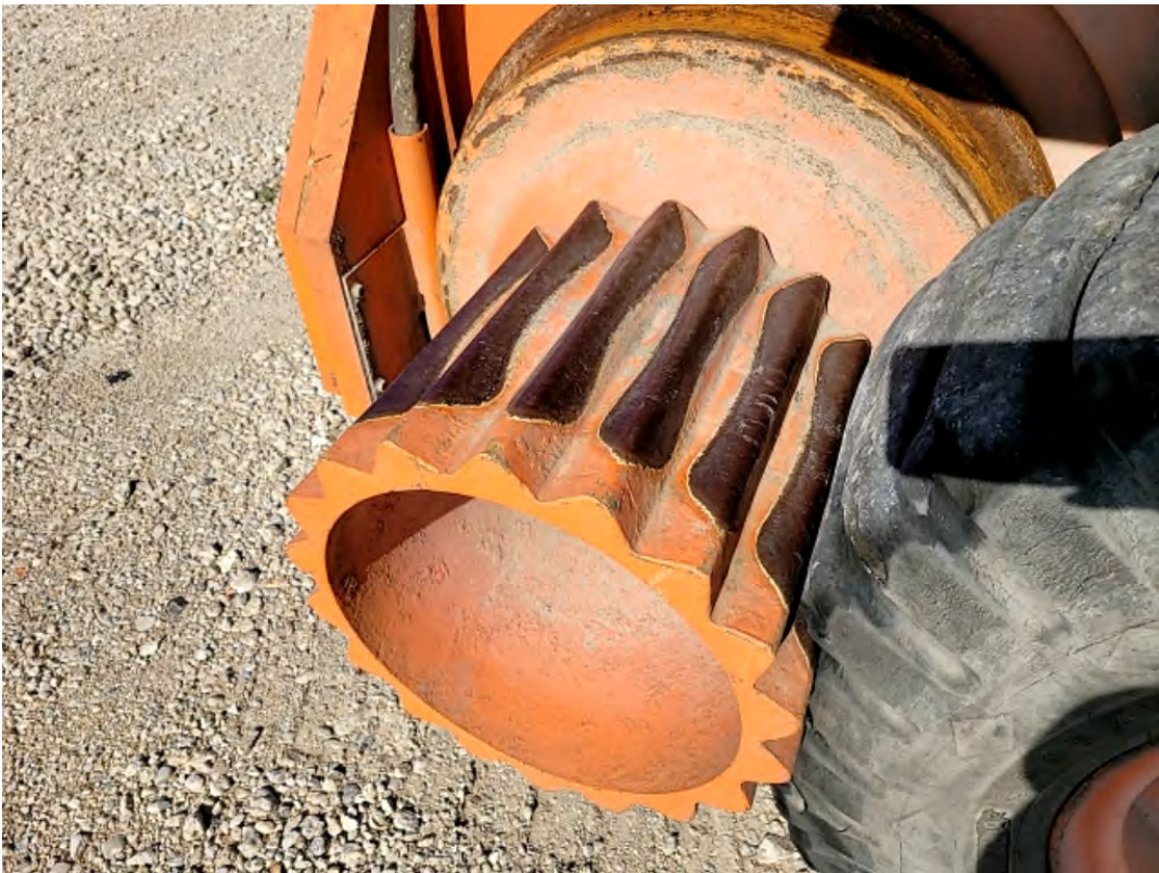
Front Left Drive Hub / 09-27-2021