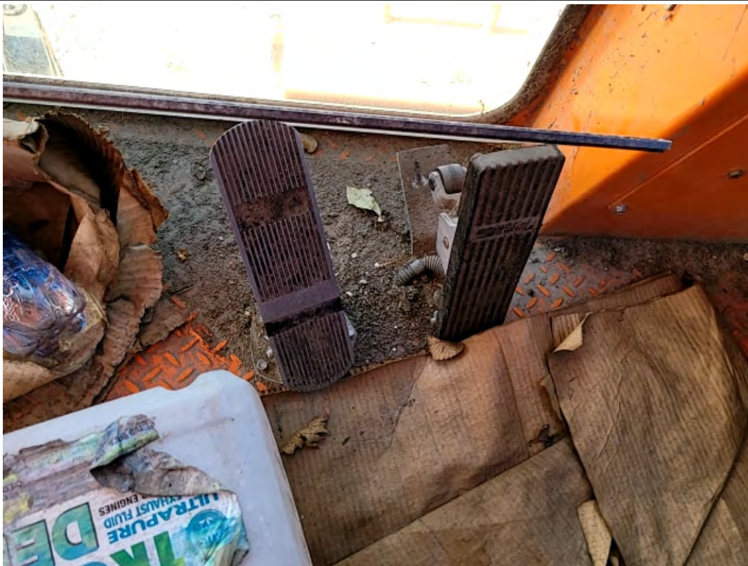
Right / Pedals / 09-27-2021