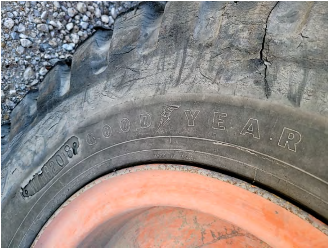
Front Right Tire Brand / Front Right Tire Part Number / 09-27-2021