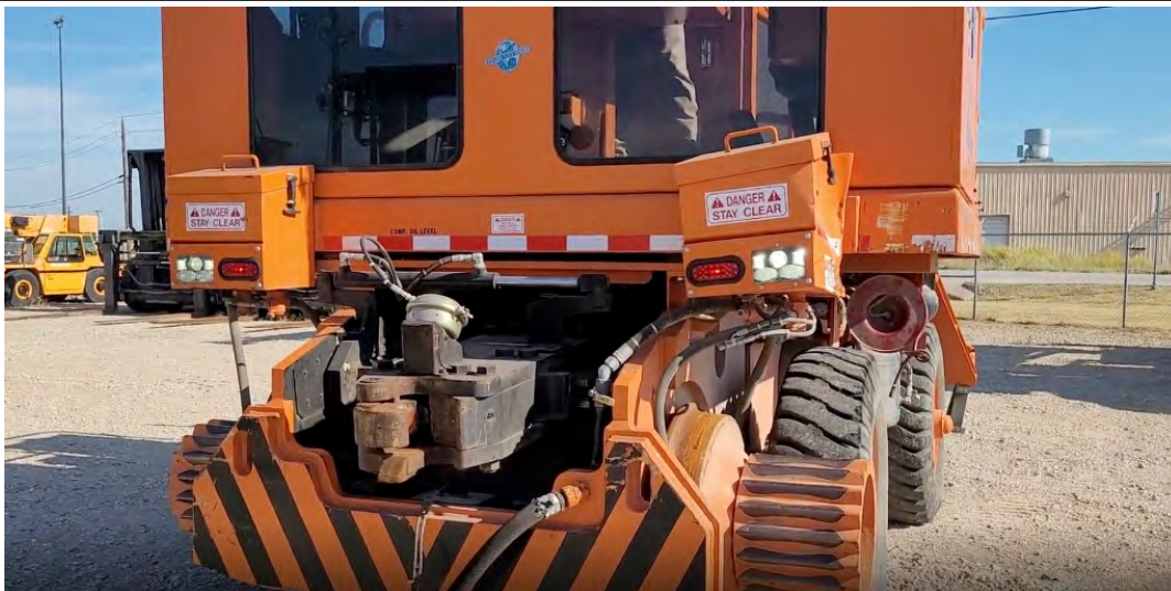
Working Lights / 09-29-2021